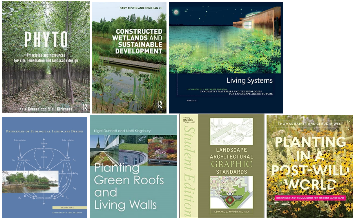
Books to aid your process and studies